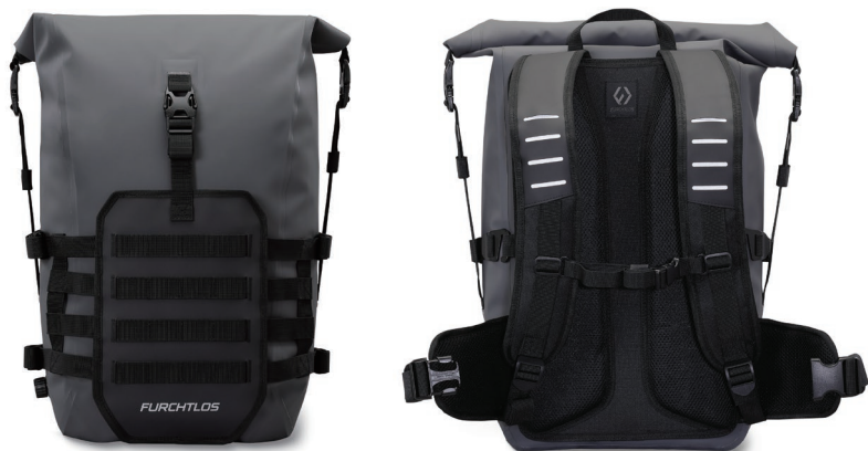
EVEREST 背包 EVEREST Backpack