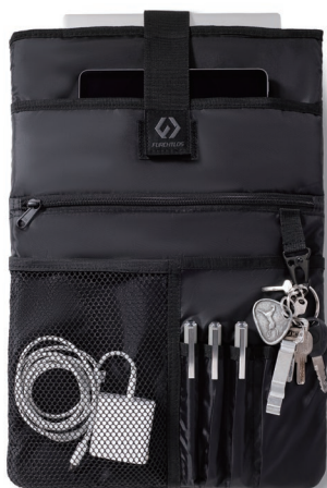
可拆卸电脑袋 Removable Laptop Pocket