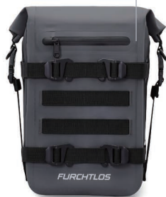
EVEREST 护杠包 EVEREST ENGINE GUARD BAG