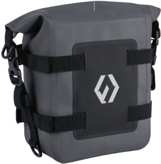
EVEREST Seat Bag x1