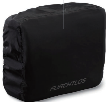
防雨罩 Rain cover