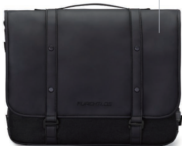
LEGACY 边包 LEGACY Saddlebag