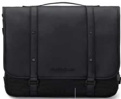
边包 LEGACY SADDLEBAG

The LEGACY Seat Bag Base can be used to attach the LEGACY Side Bag or the LEGACY Tank Bag to the rear seat of the motorcycle.