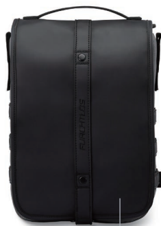
油箱包 LEGACY TANK BAG